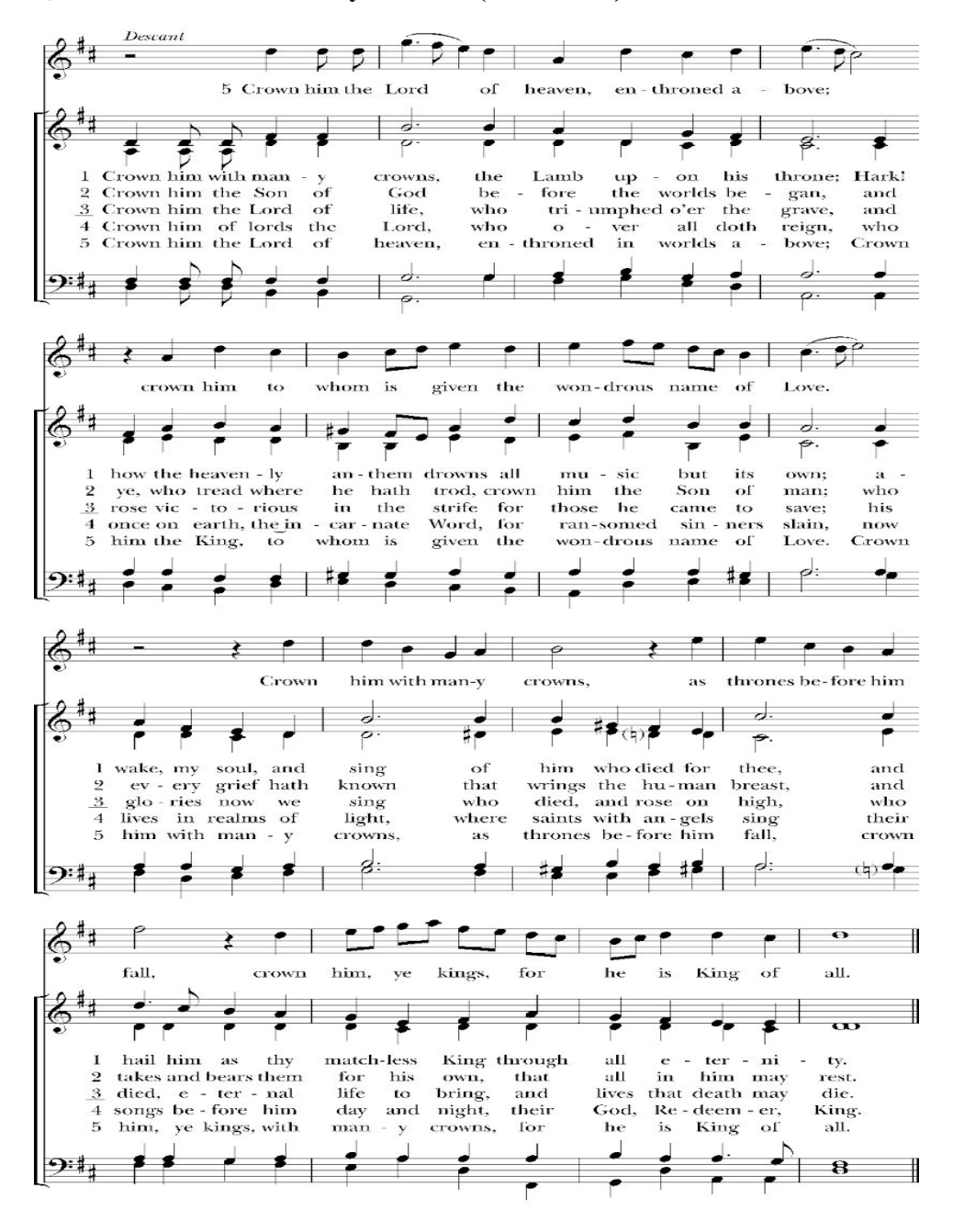
HYMN 494, Crown Him With Many Crowns (Diademata)

Almighty God, you have given us grace at this time with one accord to make our common supplication to you; and you have promised through your well-beloved Son that when two or three are gathered together in his Name you will be in the midst of them: Fulfill now, O Lord, our desires and petitions as may be best for us; granting us in this world knowledge of your truth, and in the age to come life everlasting. Amen .